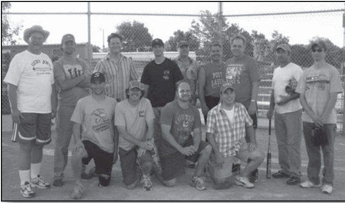
The World Softball Team

Black Hills Council of Local Governments, Northeast Council of Governments, First District Association of Local Governments, and the Planning and Development District III.