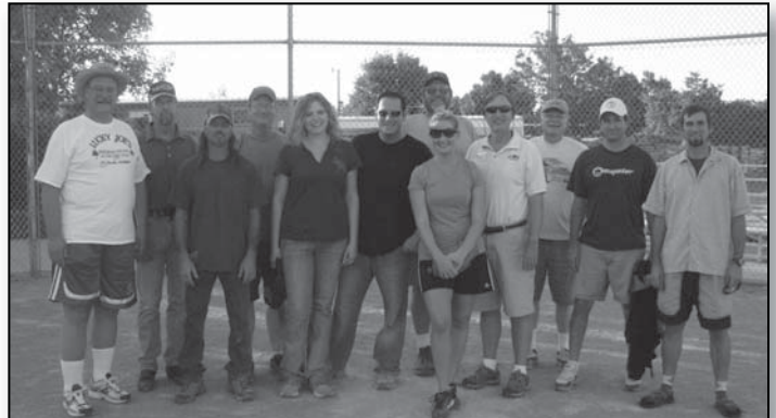
The Wyoming Softball Team