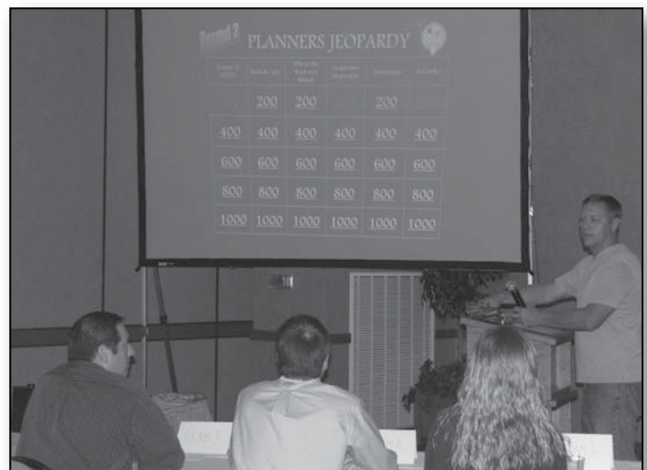
Planners’ Jeopardy at the 2009 Conference Opening Reception.

Finally, I want to thank personally the SDPA conference committee and membership for their dedication and support of this endeavor. I am proud to be affiliated with such an ambitious bunch that is committed to sound land use planning and to providing professional development opportunities to promote the best in land use planning. SDPA was pleased to showcase our state. South Dakotans are very proud of our majestic and diverse landscape and our rich western history, so consider this your invitation to again “Head for the Hills” and explore the land of infinite variety, South Dakota. 🐼